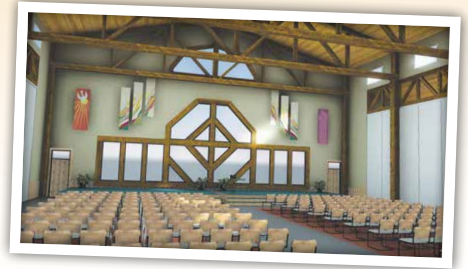
A rendering that depicts the interior of the new tabernacle.

The vision for a new tabernacle is a multi-level, multi-use worship and meeting center that contains: