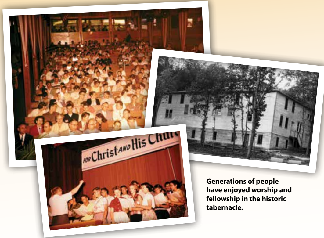
Generations of people have enjoyed worship and fellowship in the historic tabernacle.

"Fifty years ago, I was introduced to Koronis as a 15-year-old boy sensing a call to ordained ministry. The event was called Summer Assembly for teenage youth. I can still remember the warmth, acceptance, and love during devotions and the awe of the tabernacle worship. Returning many years later as executive director, there was a holy presence whenever I entered the tabernacle. It is a place where many have met up with God, struggled with life decisions and faith questions. It is time to build a new space where, when you sit down, your back will not stick to the back of the chair when it is too hot and you will not begin to shake because it is too cold—a place that is holy ground because God is with you and waits for you."