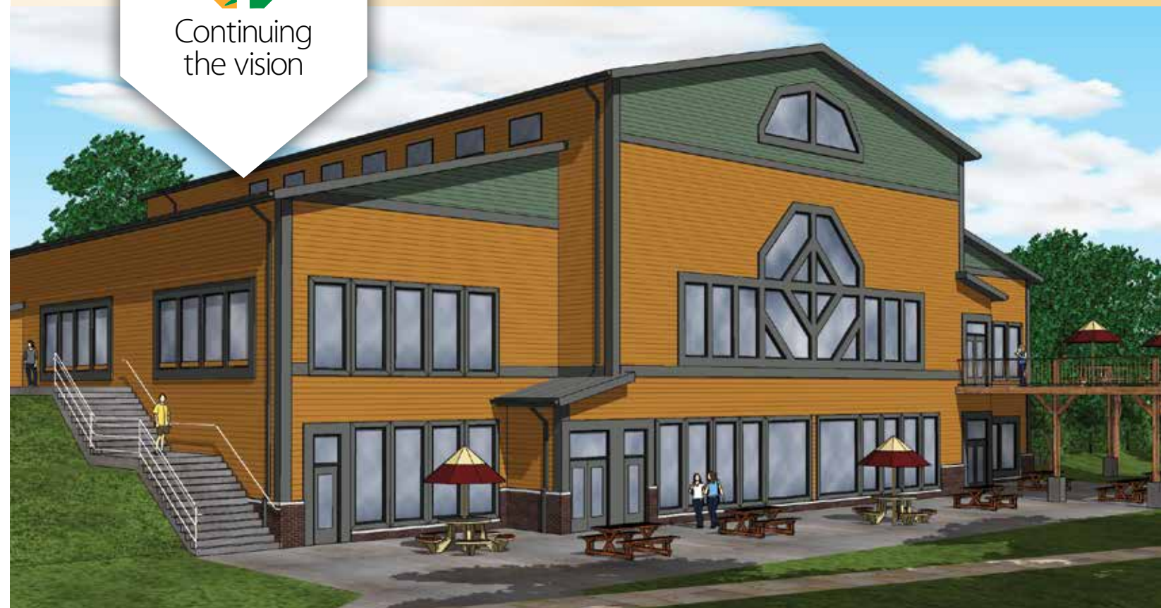
A rendering that depicts the exterior of the new tabernacle.

In 1922, Koronis Ministries started as a camp where people of faith could come together to experience Christ and enjoy creation. There were initially just two buildings—a 1,500-seat gathering space, or "tabernacle," and a dormitory. Over the past nine decades, the camp has expanded and thousands of men, women, and children have dedicated their lives to Christ in the historic building. Now, it's time to erect a new tabernacle that will honor and build upon the camp's rich history—and that will prepare it to create thousands more disciples in the decades to come.